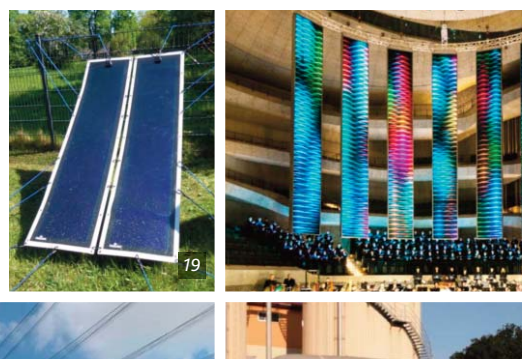
Figure 19: Heliatek modules on show at TR2022. Figure 20: Al Janoub Stadium, Al Wakrah. Figure 21: Rosalie Light Sculptures, 2017 at Elbphilharmonie for the "Symphony of a Thousand". Figure 22: Gas holder on a platform.