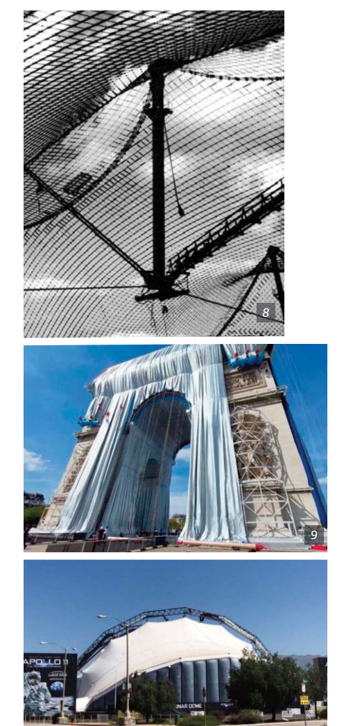
Figure 8: The flying mast, an invention of Frei Otto and his team. Figure 9: The wrapping of the l'Arc the Triomphe. Intermediate situation. Figure 10: Lunar Dome.

Dipl.Ing. Jörg Tritthardt, büro für leichtbau The special guest session was a long film entitled "L'Arc de Triomphe, Wrapped", a description of the implementation of the temporary artwork for Paris projected by Christo and Jean-Claude and engineered by "büro für leichtbau" and sbp. The Arc de Triomphe was protected and wrapped in 25.000m<sup>2</sup> of recyclable polypropylene fabric and 3.000m of red rope. A pre-assembly was done on a scaffolding structure, which resulted in some changes. An auxiliary steel structure protected the monument and its sculptures before wrapping. Several particularities of the