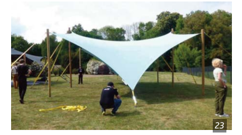
Figure 23: The participant's project.

membranes and oversized welding. Cones are used to cover pre-tanks and post digestion tanks. They can be designed to cover the slurry tank for odour containment and rainfall protection or even to be gas tight and to serve as gas single membrane. Gas holders can also be cylindrical, prefabricated and placed on a platform with no concrete foundation and no installation cost (Fig. 22). There is also the possibility of building giant gasholders for thousands of cubic meters of gas measuring 50 to 60m in diameter and a capacity of 20.000 to 40.000m<sup>3</sup>. A comparison between the spherical and cylindrical shapes reveals that the sphere has the best volume/surface ratio to store more with less surface, it resists equally the wind from any direction and the tension T of the membrane is p·R/2, dependent on the pressure and on half the radius. On the other hand, the tension of the cylinder is double T = p \cdot R , it needs more surface for the same volume and its behaviour under the wind is anisotropic. But it can be built with any length without changing the tension on the membrane and it is easier to cut and weld. Finally, a gasholder for 600.000m<sup>3</sup> was envisaged measuring 400m (length) x 76m (width) x 32m (height), reinforced with cables to discharge the outer membrane. https://www.ecomembrane.com