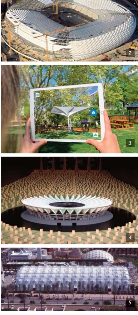
Figure 2: Allianz Arena, Munich: 2.784 pneumatically pre-stressed ETFE cushions. Figure 3: Membrane viewer "formfinder". Figure 4: Boundary layer wind tunnel. Figure 5: A continuous vaulted space with high values of reverberation time, background noise and poor intelligibility. It needs improvement.

Dipl.Ing. Michael Buselmeier, Wacker Ingenieure Realistic wind loads including dynamic effects on complex and flexible shapes are not covered in codes like EN 1991-1-4 or